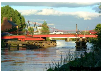
Selby Swing Bridge