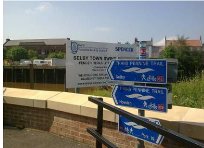
Join the Trail over the toll bridge from the Abbey