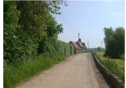
One mile from Selby

Start the route at Selby Toll Bridge which is not nowadays used as a toll. After leaving the town cross the bridge and the Trans Pennine Trail is immediately on the right and is well signed. Proceed on the river bank for a short while until the Trail widens into an excellent surface (slightly bumpy at first). Keep straight on as the Trail wends its way out through Newlands Farm towards Cliffe. Eventually, you will meet the A63 Selby to Hull road. At this point there is a cycle path on the right which runs parallel to the road for approximately one third of a mile, when you turn right away from the A63 down Main Street to Hemingbrough. Passing St Mary's Church on the right keep on for another 250 yards into Landing Lane and then go right through the gateway onto a superb single track along the side of the river Ouse all the way through to the tidal barrage at Barmby (cyclists dismount here). It's worth dismounting if cycling whilst going down the single track and climbing the banking to take in the view down the Ouse. The route now follows an on road section but there is little traffic and the road surface is excellent. The village of Asselby is particularly picturesque. Proceed straight forwards but take care when crossing the B1228 before approaching Howden where you can have a well-earned break before returning to Selby using the same route.