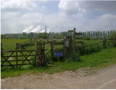
At the end of the road from Hemingbrough go through the gate and down the track