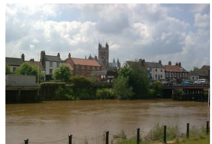
Selby Abbey in the distance at the end of the route