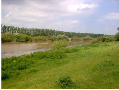
View of the Ouse from the bank above the single track from Hemingbrough