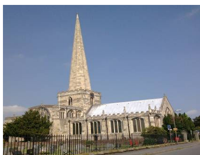
St Mary's Church, Hemingbrough