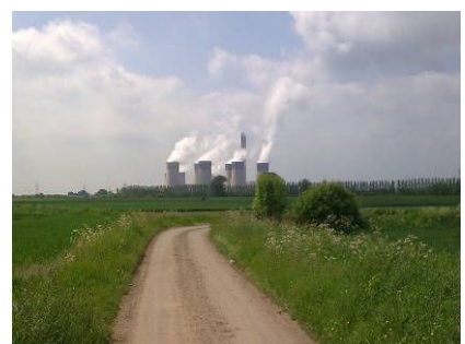
Drax Power Station dominates the skyline when leaving Hemingbrough

TPT route maps can be obtained from the Trans Pennine Trail office if required: