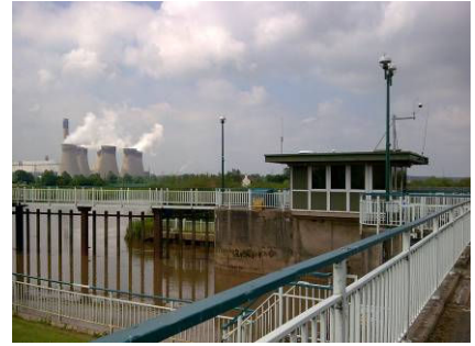
Cyclists dismount to cross the barrage on the Ouse at Barmby

Iconic architecture and sacred space makes Selby Abbey the place it is today but people have worshiped here and served the wider community for over 900 years. Selby is a small Yorkshire town, 12 miles south of York with one of the most superb Abbey churches to be found anywhere in England. Selby Abbey is often called the 'Hidden Gem of Yorkshire' as no other church has the size, the age or the beauty that makes this building so unique.