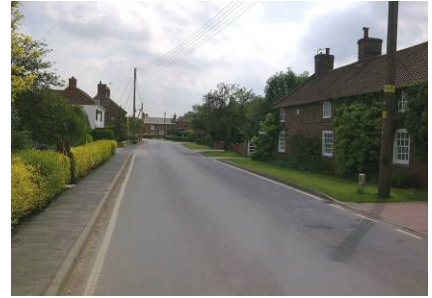
Pretty village of Asselby

Hemingbrough's St Mary the Virgin Church with its limestone tower and spire can be seen from miles around and was built in c1425 and has links to Selby Abbey and Howden Minster.